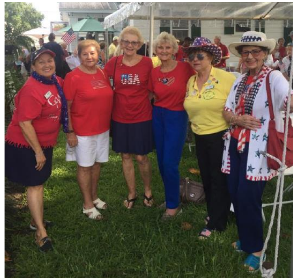
Many members attended the ceremony – these are just a few who were there to honor all Veterans.